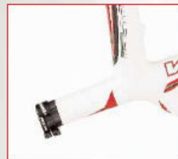
Reggisella integrato opzionale Optional integrated seatpost